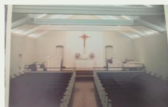
Main sanctuary with cross 1960s